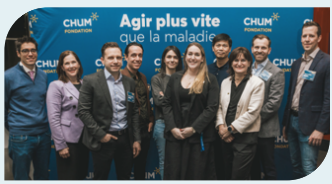
Grand Donors' Circle members