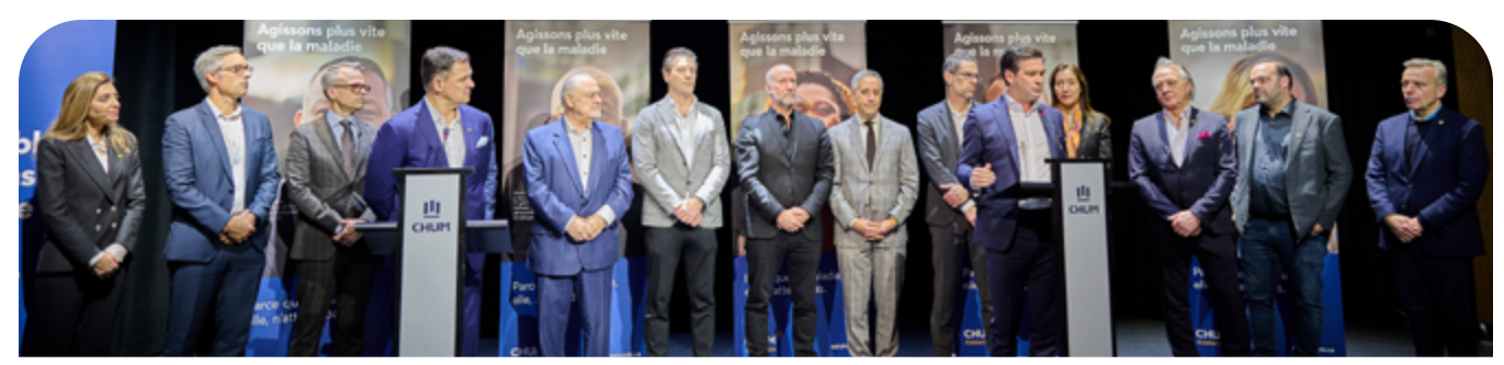
Members of the campaign cabinet

On November 16, at the CHUM's Pierre-Péladeau Amphitheatre, our foundation launched its first major fundraising campaign since the new CHUM was built: Act faster than disease. This bold, ambitious campaign is propelled by the generosity of our community and will run until 2028. Its goal is to create solutions enabling the CHUM's teams to go further and act faster.